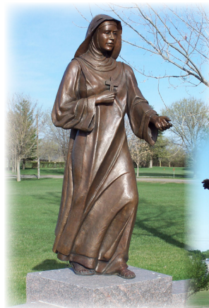
St. Scholastica & St. Benedict