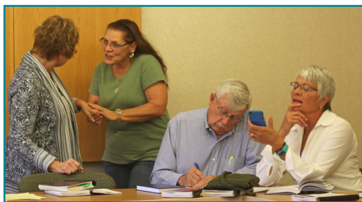
Oblates after a formation meeting gathering for both fellowship & learning

Oblates - seek to incorporate Benedictine values into their everyday life, extending the spirit of the monastic community into other areas of the local community.