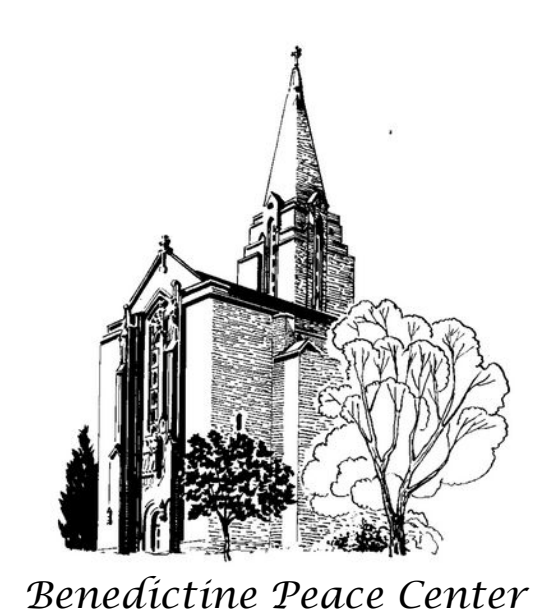
A ministry of the Benedictine Sisters of Sacred Heart Monastery

1005 West 8th Street Yankton, SD 57078 605-668-6292